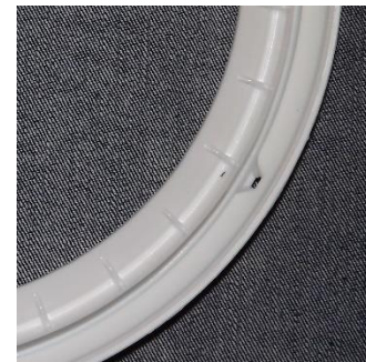
Close up of groove in the front ring

The track needs installed in the front before placing the track into the back of the wheel.