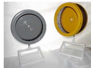
Assembled and ready to use!

Lay the back on your lap, put the front & track into the groove. Follow Step 2 directions to complete installation.