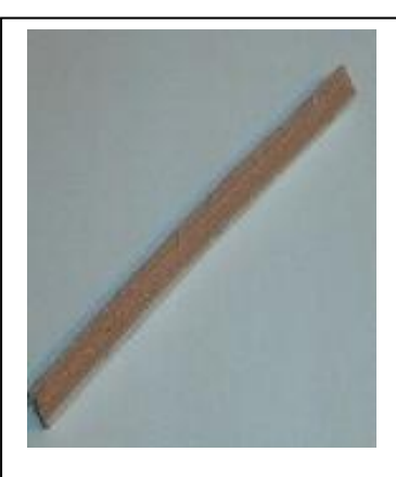
Step 3: Remove 1 adhesive strip and adhere one strip of molefoam to the other, retaining 1 adhesive strip at bottom for later use.