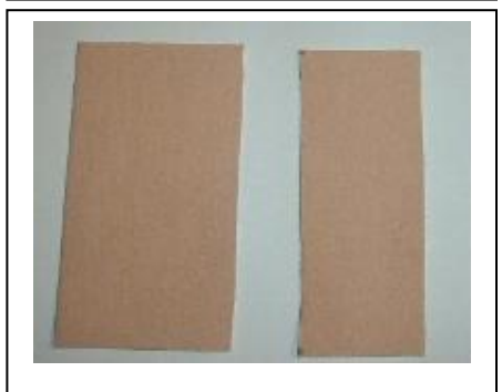
Step 5: Using 1 sheet of Dr. Scholl's Moleskin, cut 1 strip 1-3/8" wide down length.