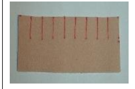
Step 6: Cut \frac{1}{2} " deep slits at \frac{1}{2} " intervals down length of Moleskin strip.