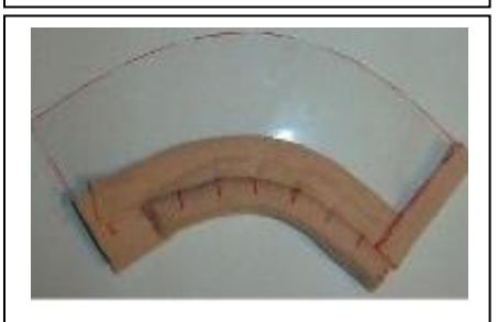
Step 13: Wrap overhang of Moleskin around edge of collar, completely covering edge.