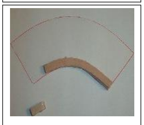
Step 4: Cut ¾" off end of dual layer Molefoam. Remove adhesive backing and adhere to clear plastic as shown.