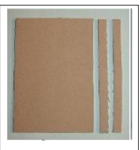
Step 2: Using 1 sheet of Dr. Scholl's Molefoam, cut 2 strips ¼" along edge.