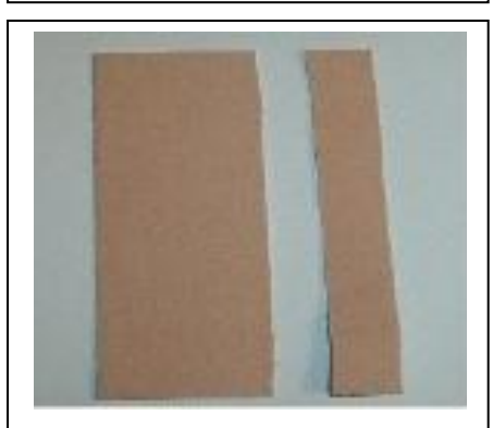
Step 9: Cut 1/2" strip from Moleskin.