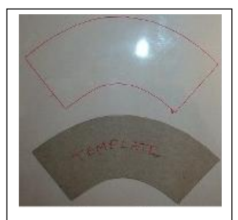
Step 1: Trace template onto clear plastic notebook cover, then cut out.