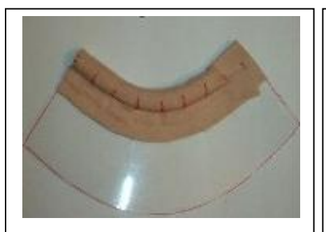
Step 10: Remove adhesive backing and adhere over slitted Moleskin, above thick layer, to cover the splits made from the contouring.