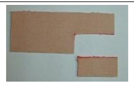
Step 11: Cut 1 strip of Moleskin 1-3/4" long by 5/8" wide.